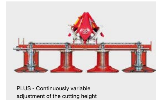
PLUS - Continuously variable adjustment of the cutting height

To improve crop flow, the bodies of the inside drums have a smaller diameter. Swath formation is improved too and the drum mower runs more smoothly, especially in high volumes of forage.